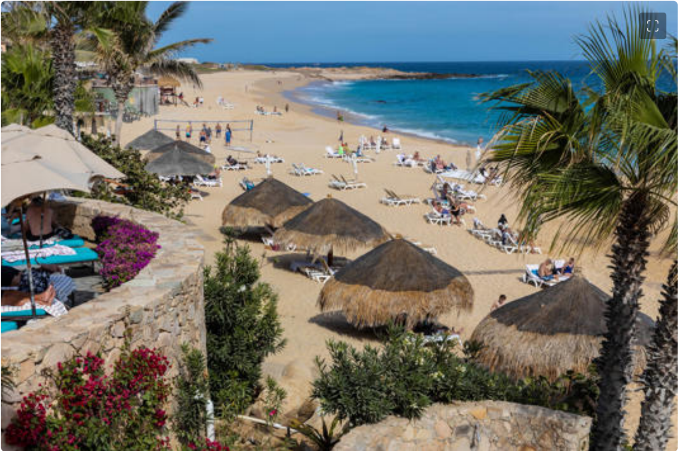
Enjoy sand, sun AND shade by choosing a beachside palapa at Hacienda del Mar Resort in Los Cabos, Mexico.

Trailing behind "Eagles" fans we didn't wait to hear those "mission bells" ring before following them to the "Hotel California." The front door was open, but the rooms were closed and locked and the desk manager pointed us to the adjacent bar-and-grill, still open. "We're hoping for a renovation," she said, "if only they can find a new owner."