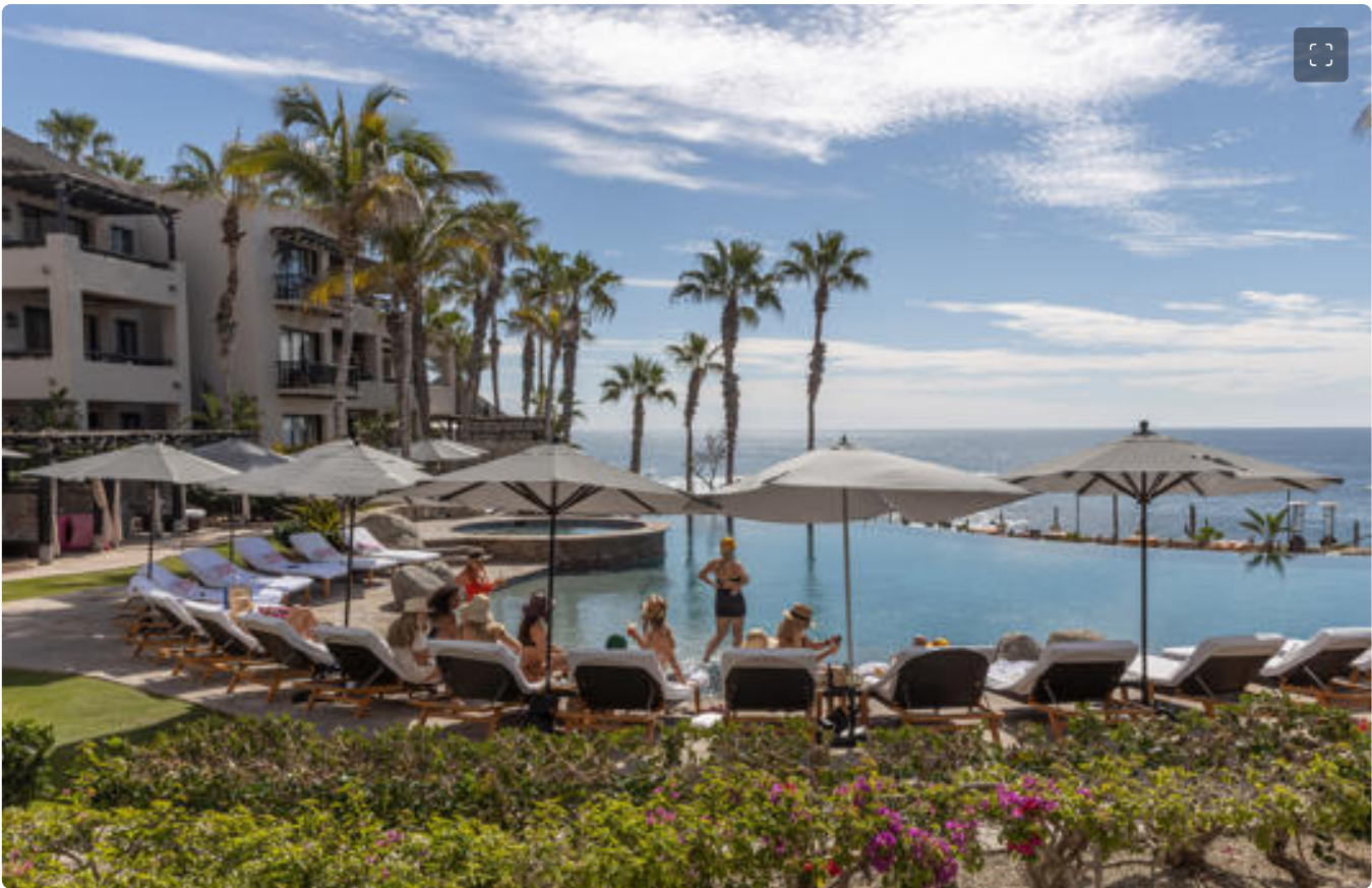
There are no bad days at the La Palapa pool, Esperanza Resort, an Auberge property in Los Cabos, Mexico.