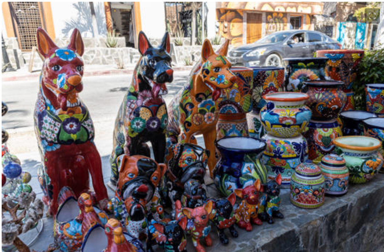
Tourists can't resist Mexico's colorful ceramics and dogs that don't bite, for sale in Todos Santos, Los Cabos, Mexico.

For some guests, a brisk walk through the Esperanza's gardens and an open-air lunch at La Palapa makes the day. But for others it's all about fun-in-the-sun, from swimming pools to beach-side bars, and cooking classes to golf courses and pickleball courts. You're as likely to meet a Hollywood celebrity as a lawyer from Indiana.