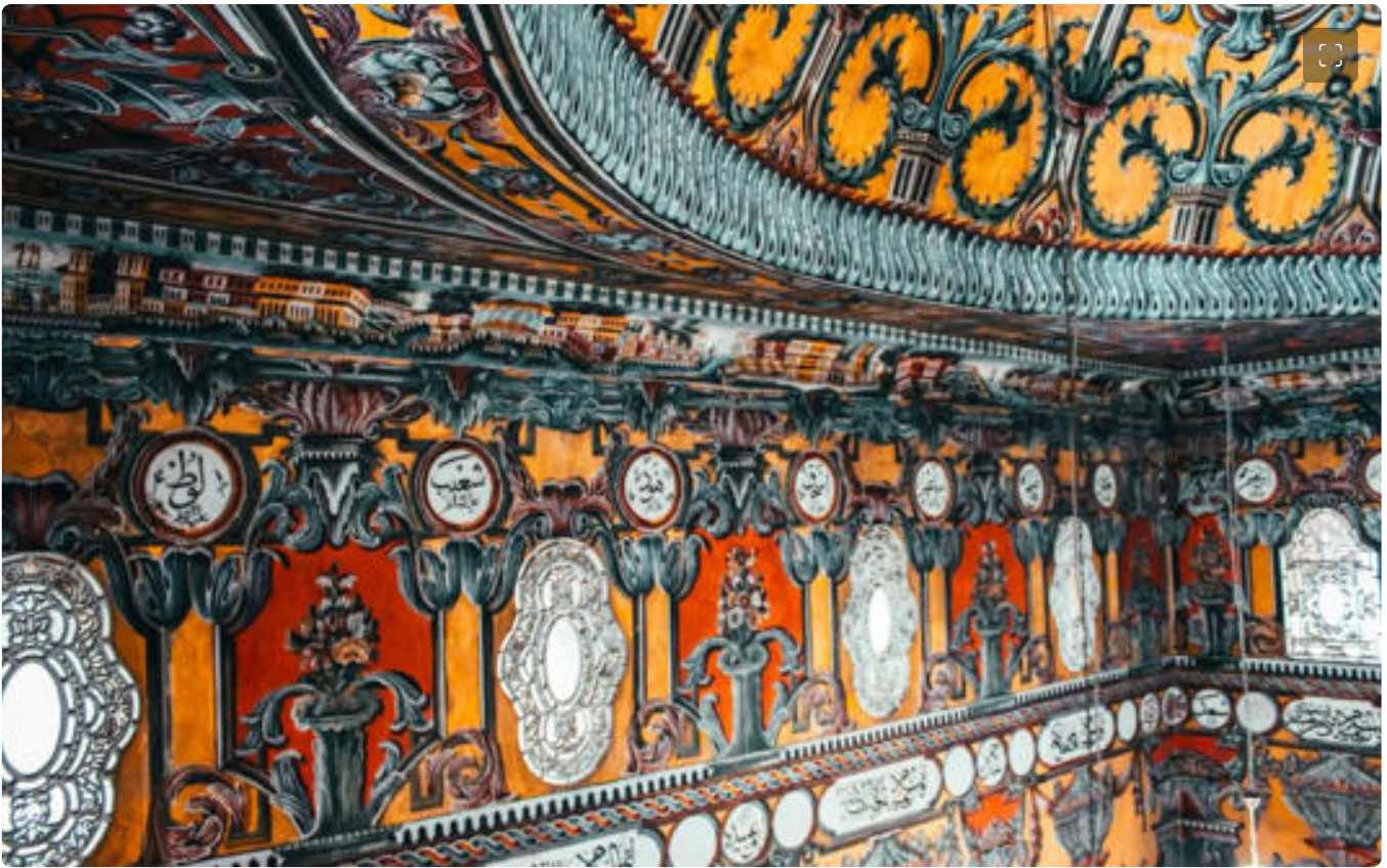
artwork on wall of islamic center representing mosques in latin america

From detailed tile work to tall minarets, these mosques show the area's beautiful and varied Islamic art and architecture.