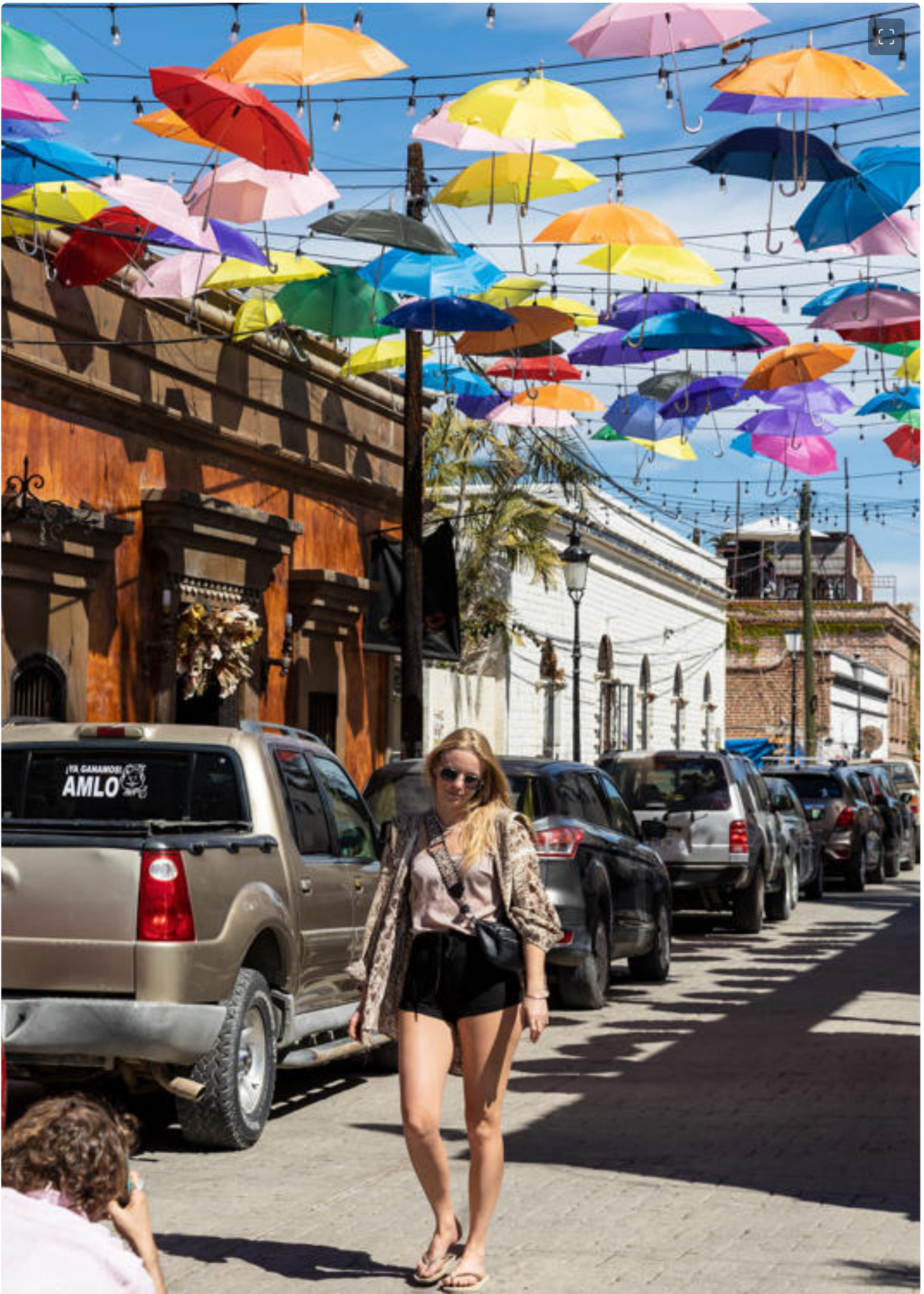
Sunny days in Todos Santos deserve umbrellas, and the brighter the better, in Todos Santos, Los Cabos, Mexico.