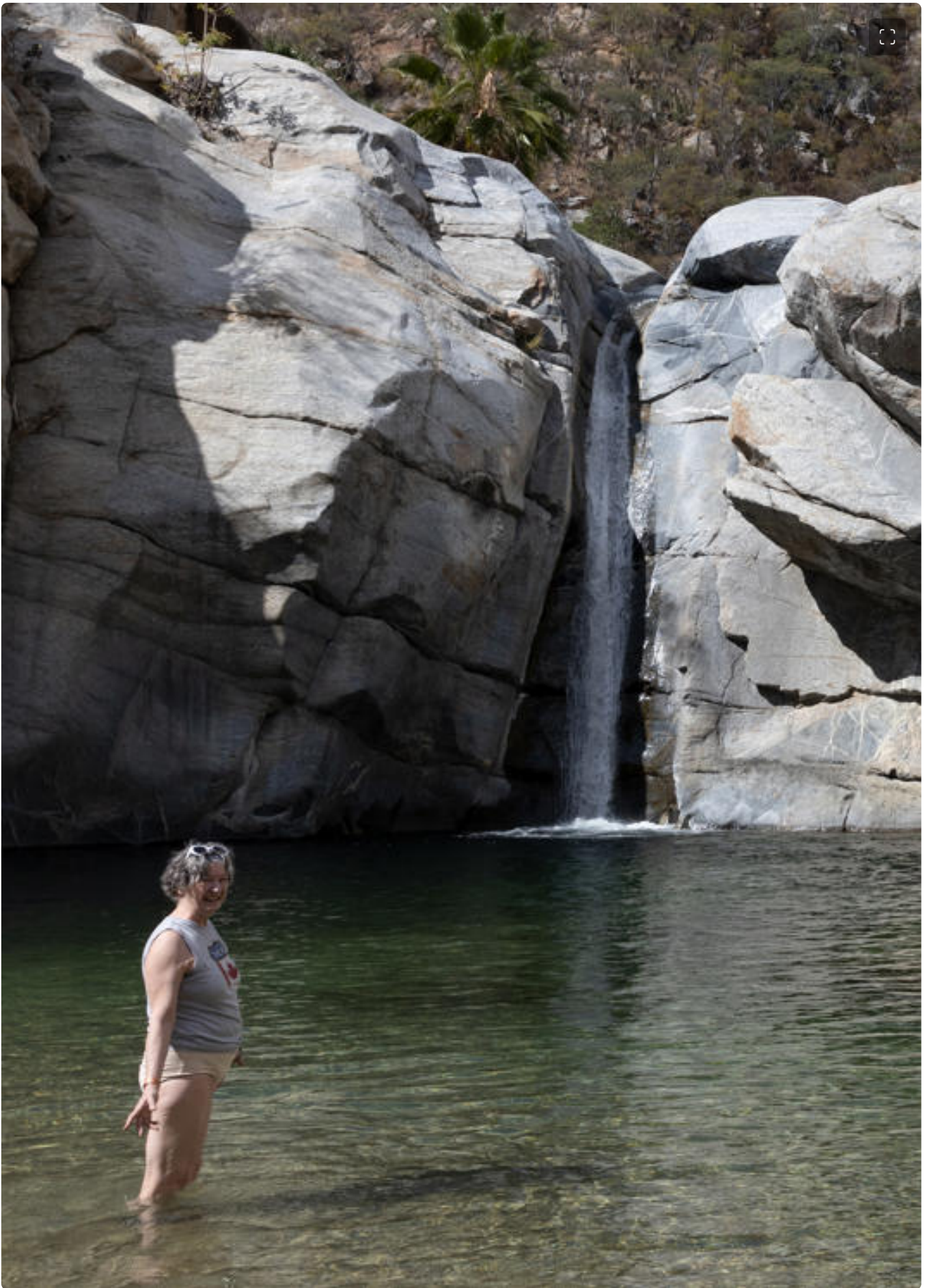
The hike to the waterfall is the highlight of a trip to the Sol del Mayo biosphere reserve, near Santiago, Los Cabos, Mexico.